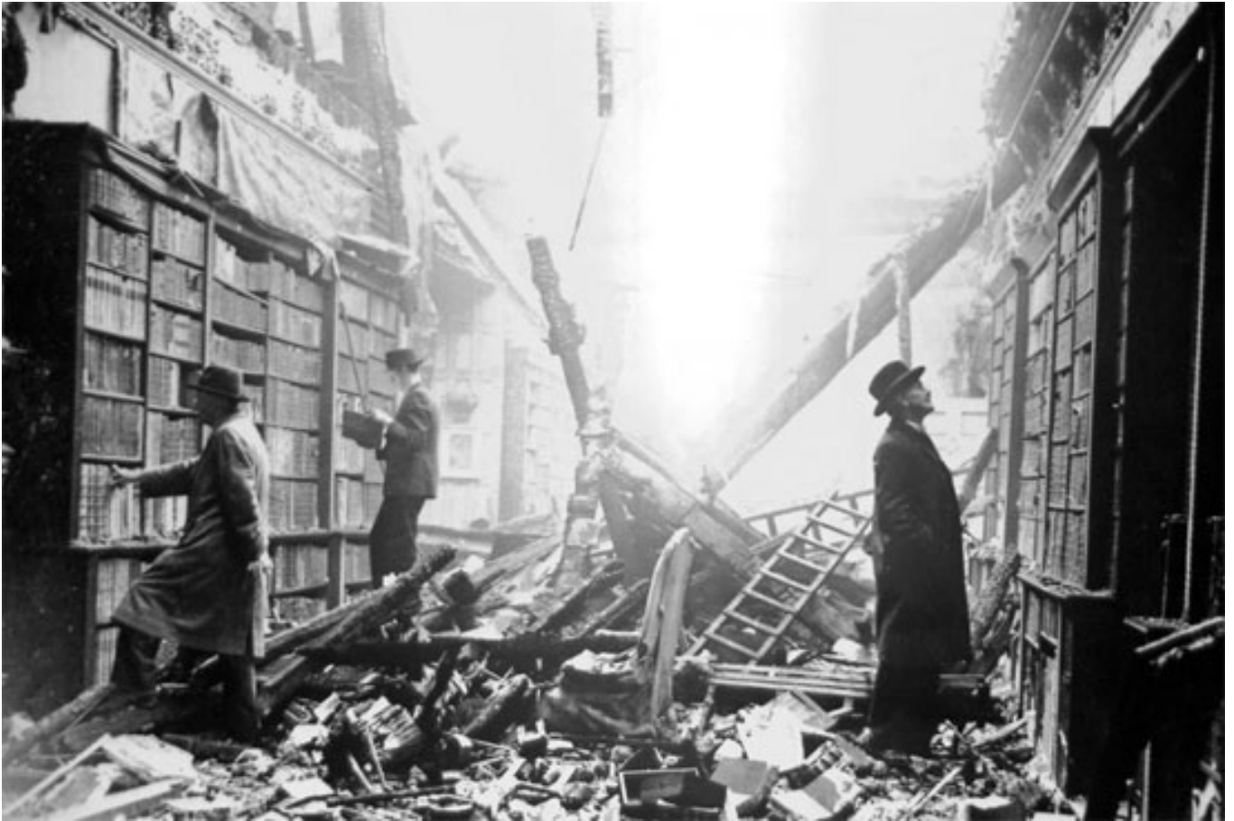
The London Library after the Blitz, c. 1940.